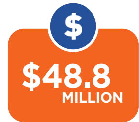
ECONOMIC IMPACT FOR STATE AND LOCAL ECONOMIES DUE TO VISITOR SPENDING