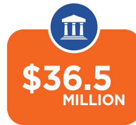
GOVERNMENT REVENUE IMPACT